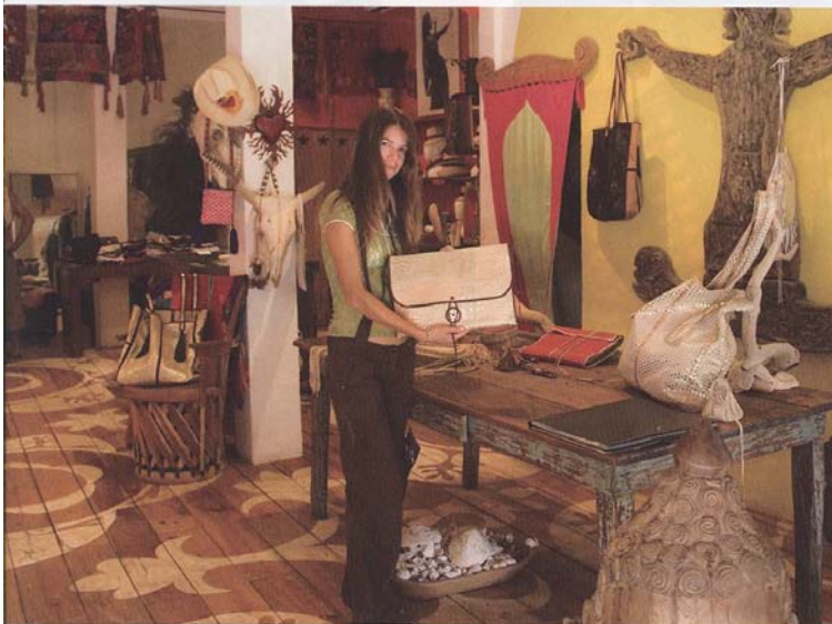
Shops in Sayulita offer high-quality handicrafts

pulque, from the agave plant, is applied to the body using a combination of massage techniques. These two ancient Mexican ingredients relax and rejuvenate the body while the stroke pattern promotes healing and detoxifying. It was tempting to stay at Punta Mita 24/7, but curiosity prevailed, and we