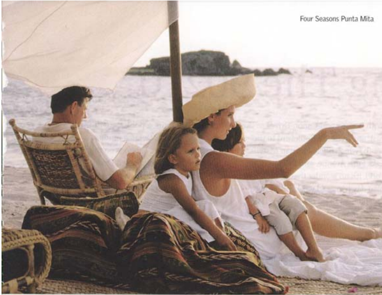
Four Seasons Punta Mita